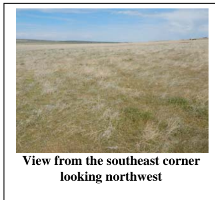
View from the southeast corner looking northwest