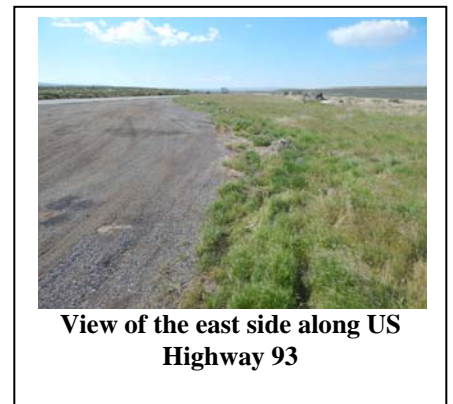
View of the east side along US Highway 93