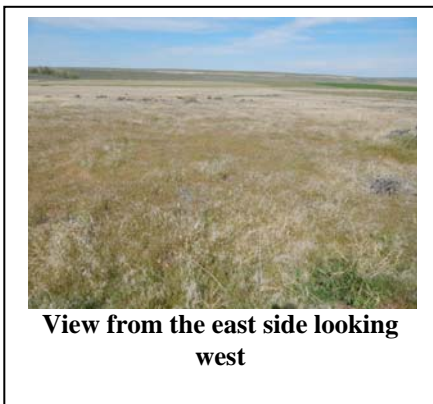
View from the east side looking west